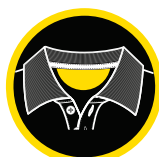
HALF MOON YOKE